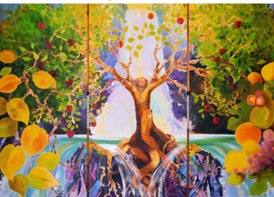
Sacred Hope in Action

Healing Creation: Sacred Hope in Action Retreat Saturday, April 5th from 9am-3pm, Location TBD