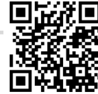
APRIL Sign Up