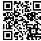
MARCH Sign Up